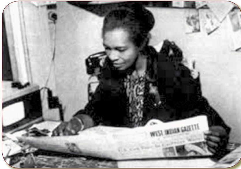
Claudia Jones (1915-1964)

Claudia Jones was born in Trinidad and worked as a journalist in both the USA and Britain. She is famous in Britain because of her work as editor of The West Indian Gazette and the Afro-Asian Caribbean News. She was also a political activist who campaigned for equal rights throughout her life. These pictures of Claudia Jones were taken in the 1950s when she was working as a journalist, newspaper editor and campaign organiser.